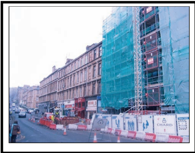
Gibson Street construction

And that's just what's happening along Otago and Gibson Streets!